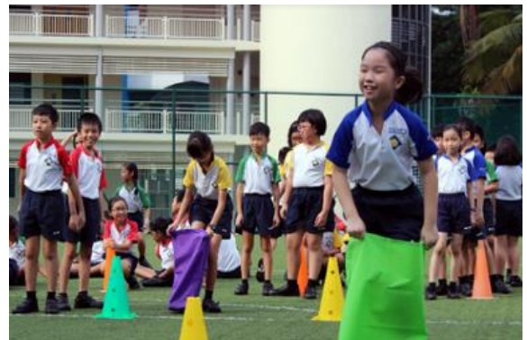
Seng Kang Primary School Uniform from 2012 to Present