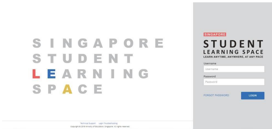
Fig. 1a: Login Page

2. SLS can be accessed from https://learning.moe.edu.sg . The username can be found in the cover letter while the password is in a separate letter.